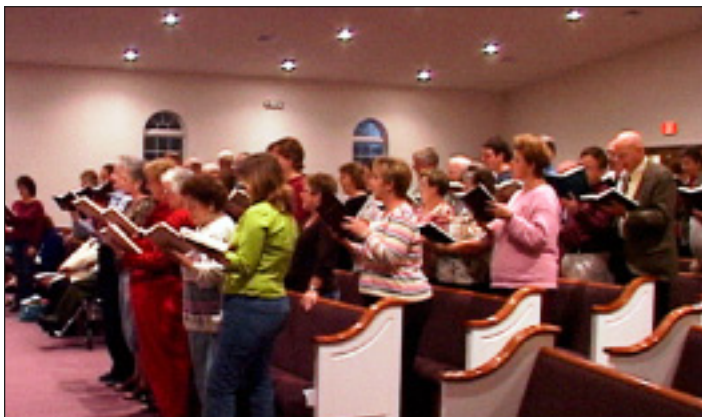
The choir and congregation of Pleasant Grove sing an old hymn to the accompaniment of the reed pedal organ.

The Church decided that the recording session should be a worship service and not a performance. Using the theme, "For the Glory of God," plans were made to devote the Sunday evening worship service on October 29, 2006 to the recording. During the extended two-hour worship service,