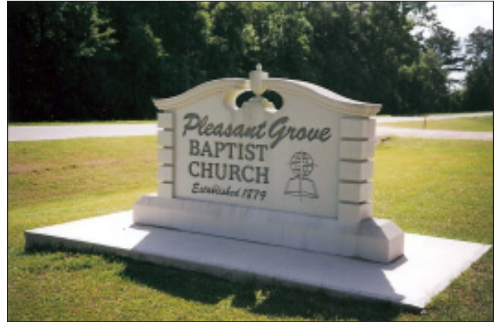
Pleasant Grove Baptist Church was established in 1879.