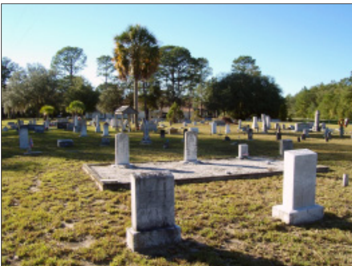
In the shadows of the trees in the peaceful grove surrounding the Church, the headstone markers in the Pleasant Grove cemetery are silent reminders of those who cherished worship services with reed pedal organs.