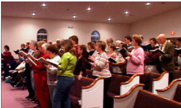
The choir and congregation of Pleasant Grove sing an old hymn to the accompaniment of the reed pedal organ.

The Church decided that the recording session should be a worship service and not a performance. Using the theme, "For the Glory of God," plans were made to devote the Sunday evening worship service on October 29, 2006 to the recording. During the extended two-hour worship service,