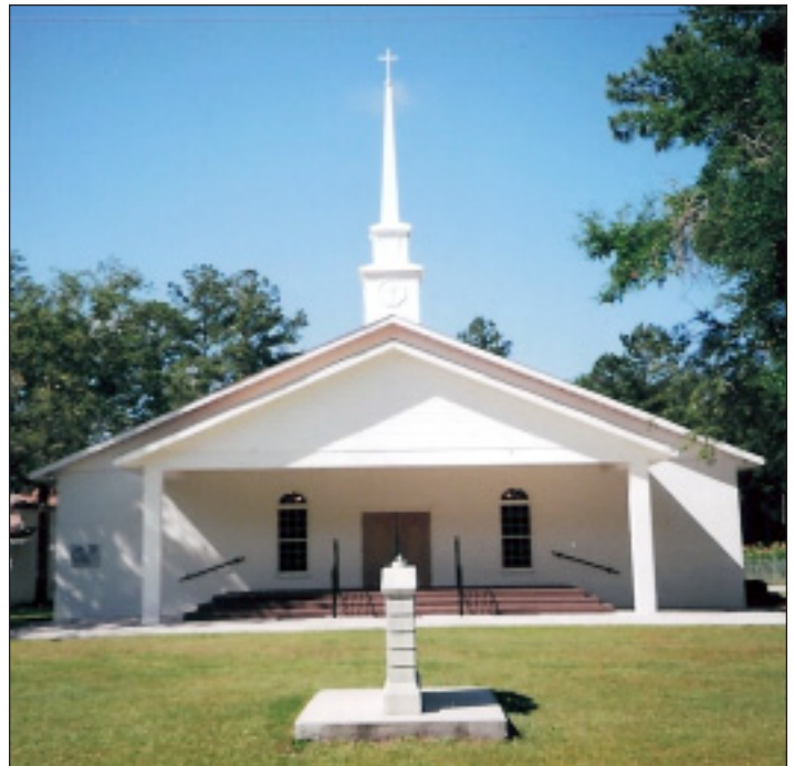
The HYMNS OF YESTERYEAR album was recorded in the sanctuary of this new building which the Church moved into in 2002. It is located on Alton Wentworth Road between the villages of Shady Grove and Eridu in rural Taylor County, Florida.